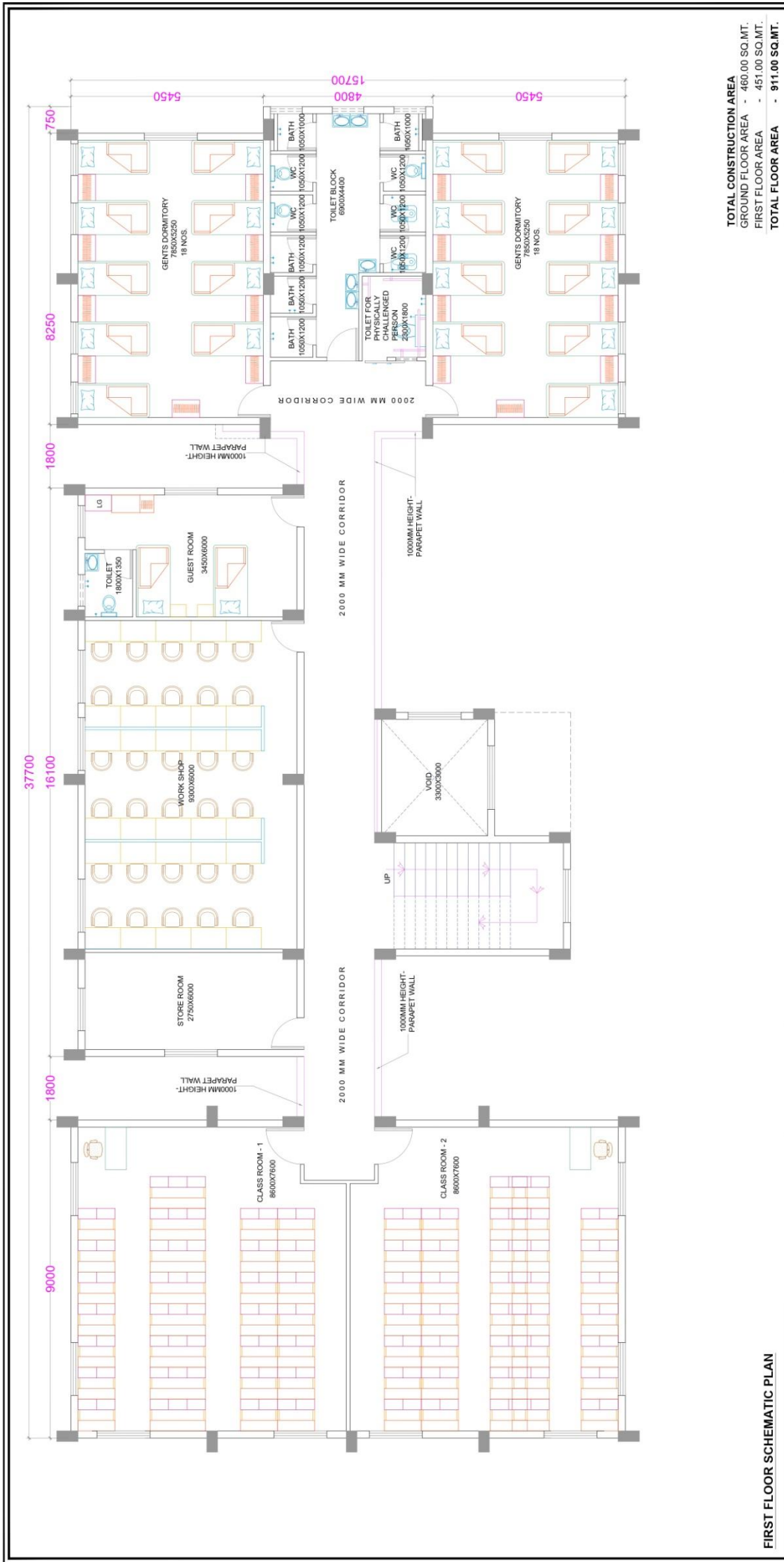
FIRST FLOOR SCHEMATIC PLAN

PROPOSED CONSTRUCTION OF RURAL SELF EMPLOYMENT TRAINING INSTITUTE BUILDING FOR ANDHRA BANK SITUATED AT SIDDIPEET, TS.